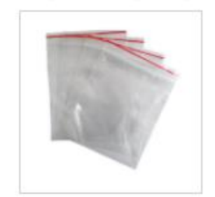
Poly Bag ( LDPE , PP , HDP )