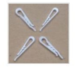
Plastic Clip ( Shirt Clip , Drop Loop )